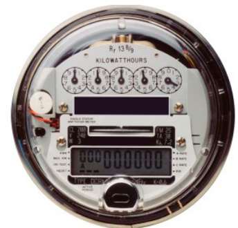
Will "smart meters" be enough?

province shouldn't depend exclusively on these programs to gain generating "capacity". Instead, we have to anticipate future growth and build sufficient baseline and peak generating capacity to handle our future needs.