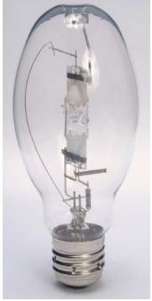
Digital electronic HID ballasts solve many of the problems of traditional magnetic HID ballasts