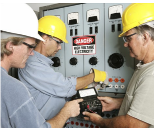
Make sure you verify the supply voltage before purchasing

It matters because the voltage system in Canada is different from the United States. In the US, three-phase electrical service for commercial and industrial customers is at 480 volts, meaning that tapping one leg to ground provides 277 volts; in Canada, our three-phase